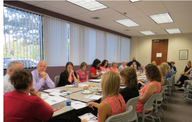
In-House Chair Training Meeting