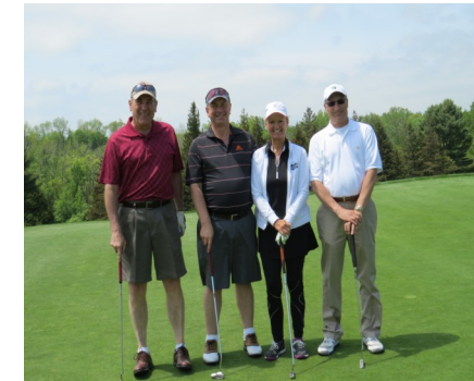
United Way Golf Tournament