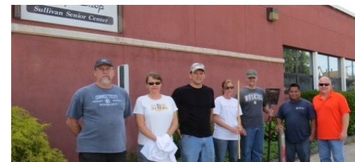
2014 DAY OF CARING VOLUNTEERS