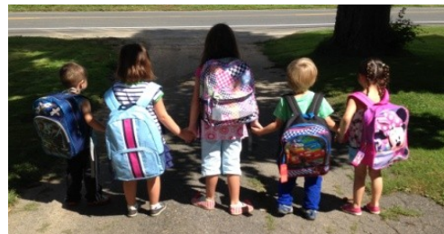
Back to School Clothes for Kids

This publication recognizes United Way of Northwest Connecticut's donors and workplaces that Give Hope and Change Lives . On behalf of the lives positively impacted, United Way extends its deepest thanks to all who gave selflessly investing in our communities in the 2014 calendar year. (Excluding those who wish to remain anonymous)